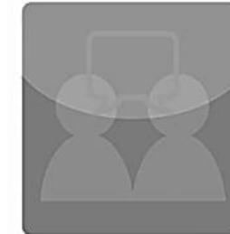
Ask A Friend